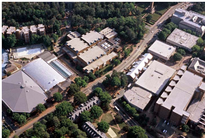
Figure 2. Potential Application of Rooftop Storage