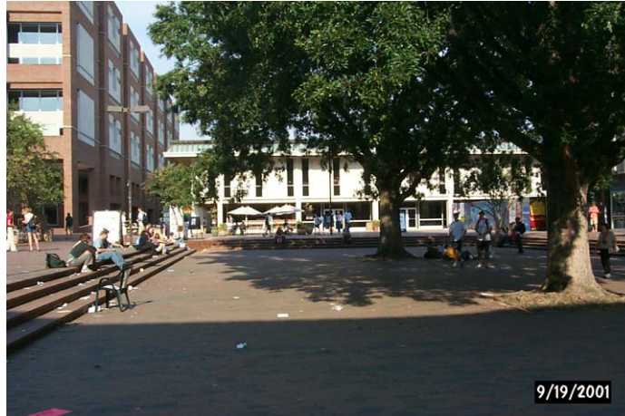
Figure 1. Potential Application of Plaza Storage