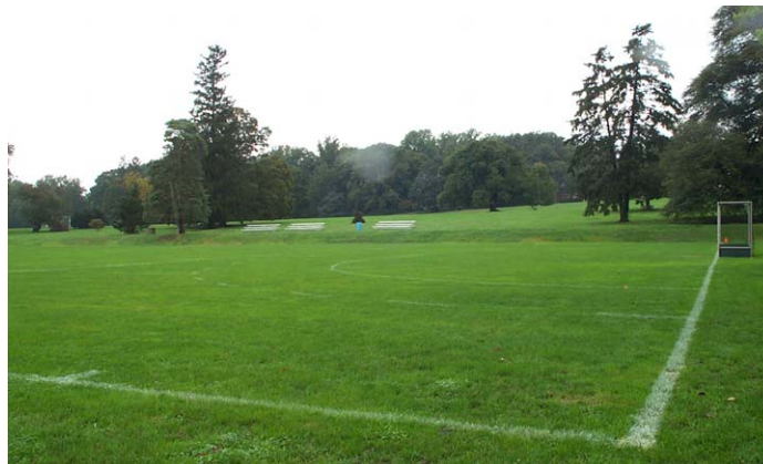
Figure 4. Potential Application of Athletic Field Storage