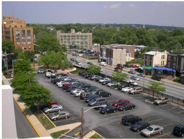
Figure 1. Potential Application of Parking Lot Storage